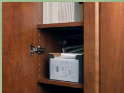
Cabinetry is finished inside and out with full backs, adjustable shelves.