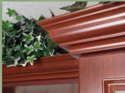
Dramatic crown molding completes built-in custom cabinetry.