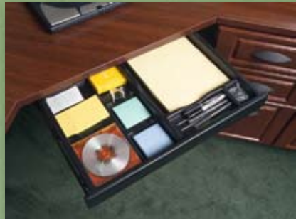
Separate compartments divide pencil tray for storage of paper, pens and other desk accessories.