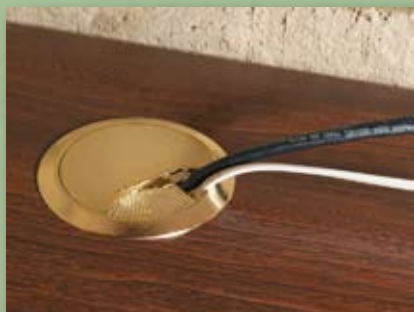
Desktop grommet, available in several finishes, guides cables and cords.