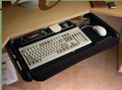
Keyboard tray slides on full-extension guides with adjustable tray tilt.