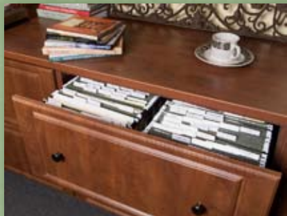
Filing frame adjusts for legal or letter contents in regular or lateral drawers.