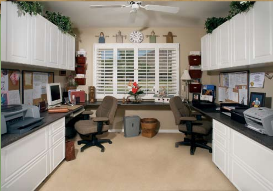
Top: Maple wood grain finish home office with his 'n' hers sections, raised panels and peninsula shared conference area. Above: Raised Panel his 'n' hers home office with custom countertop.