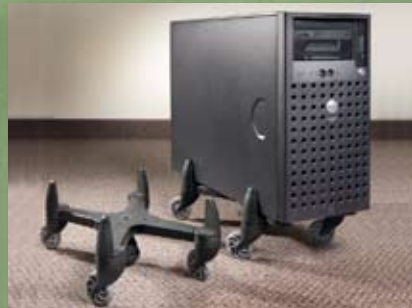
CPU cart adjustable within 10" width, holds up to 75 lbs., caster support.