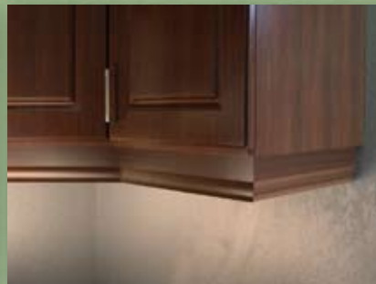
Decorative molding may be used for base, backsplash or light valance molding for finishing the traditional office design.